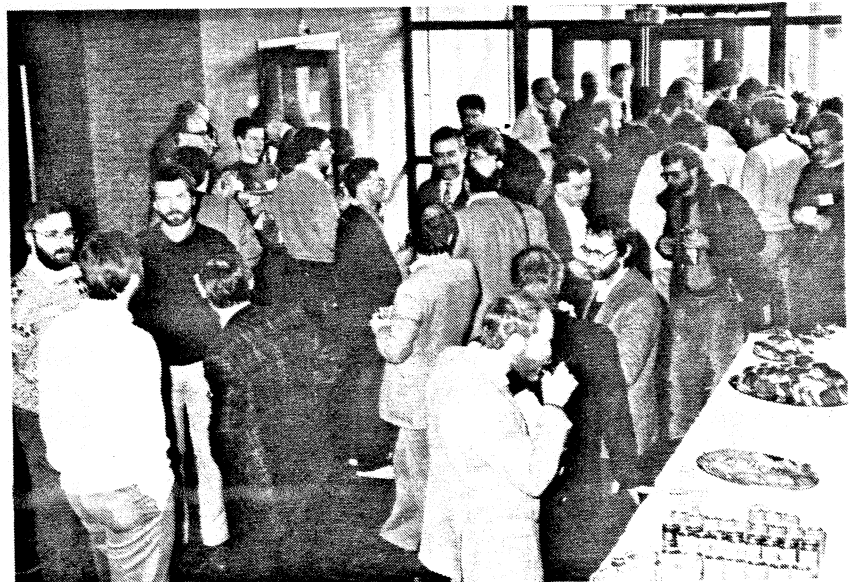
Dutch, French and German computer scientists at CWI, Amsterdam.

In the past years, information technology has more and more become a key technology. In the competition with the United States of America and Japan, the European countries will be able to keep up the better, the more their research activities are coordinated, their resources are combined and duplicate work is avoided. This will facilitate the attainment of joint strategic goals without dissipating the scientific